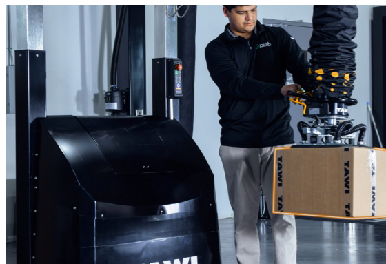
TAWI Mobile Order Picker

We work to understand the space you have available and which of our products would work seamlessly within your business.