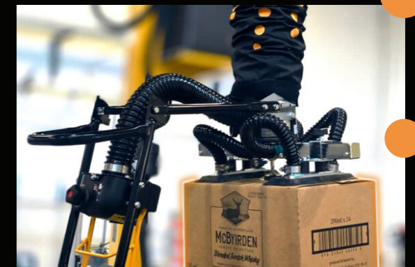
TAWI Multifunctional Lifter

The TAWI Multifunctional Lifter lifts up to 270kg with vacuum technology, swiftly switching suction tools for various loads like plastic bags or fragile glass. An extended handle option assists in manoeuvring large loads or reaching deep into pallet racking.