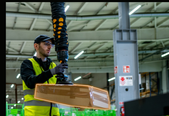
TAWI High-Frequency Lifter

The TAWI High-Frequency Lifter picks up boxes of all shapes and sizes, securely gripping them with ease, without damaging any packaging. It's a testament to our commitment to efficiency and care.