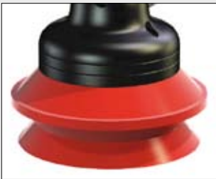
A closer look at one of the special silicone suction cups used for this suction foot. Better suited for the cold environment.