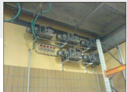
All five vacuum pumps neatly tucked away in the upper corner of the warehouse. A small jib crane is installed beside the pumps to facilitate service and maintenance work!